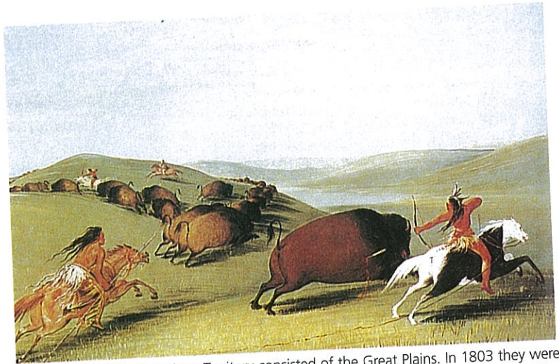
A Much of the Louisiana Territory consisted of the Great Plains. In 1803 they were inhabited by Native Americans such as these hunters painted by George Catlin.